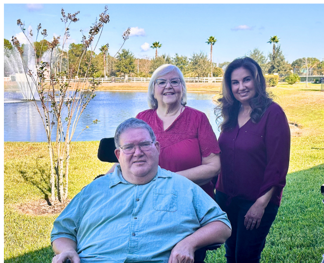
L14E Team Christmas Photo